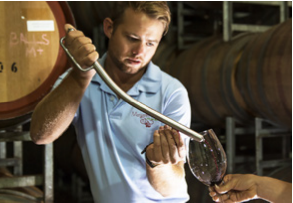
MARGARET RIVER, WA

When you wake this morning, take in the full spectacle of the Blue Mountains right on Sydney's doorstep. After your arrival into Katoomba, select from numerous mountain experiences before completing your epic transcontinental crossing at Sydney's Central Station. (B,L)