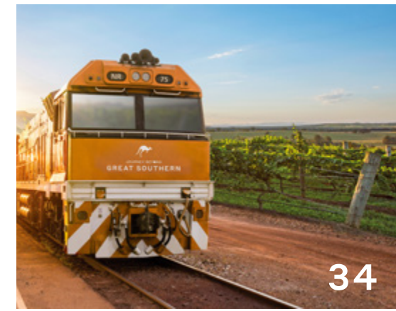
GREAT SOUTHERN JOURNEYS