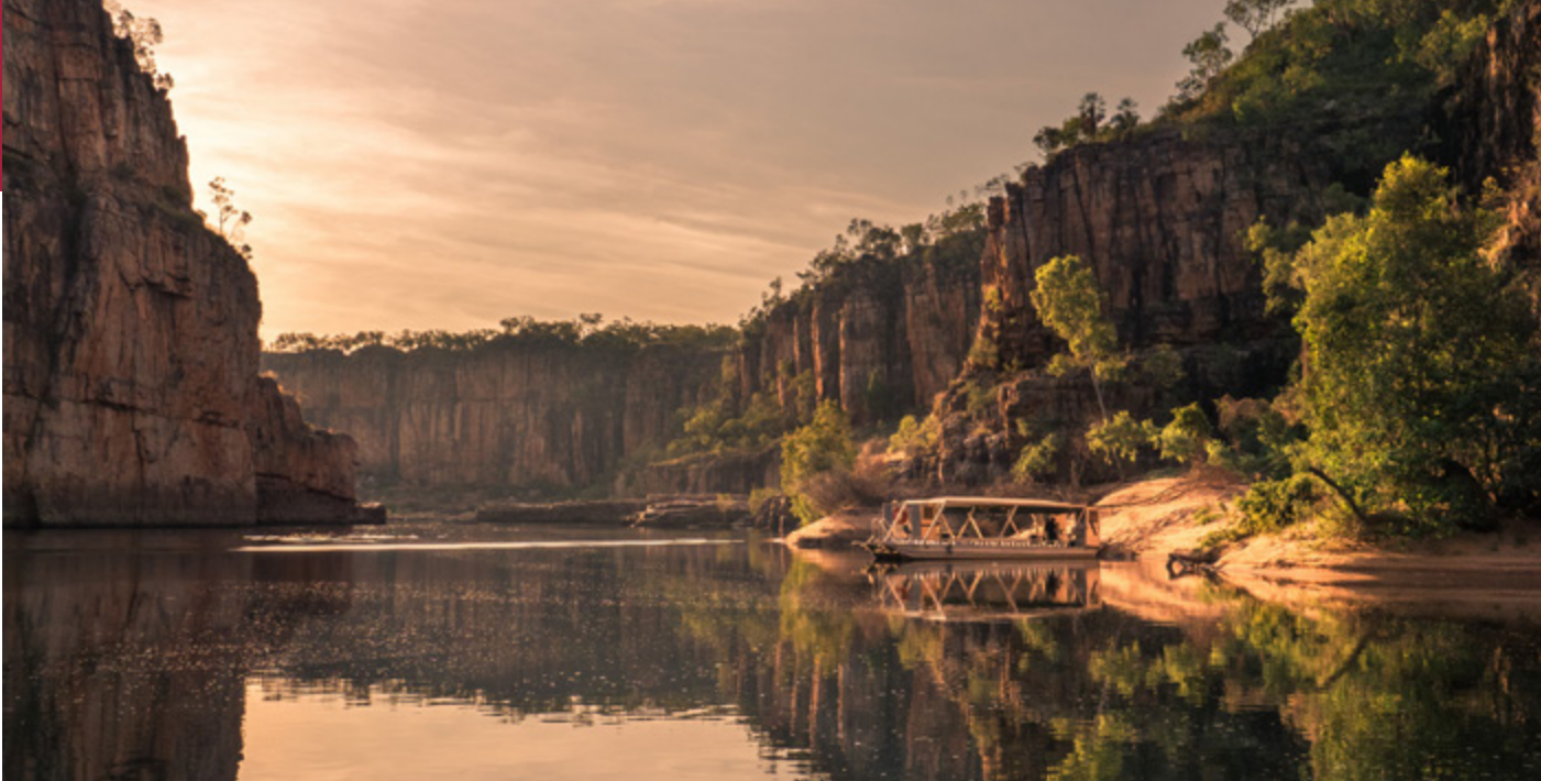
NITMILUK (KATHERINE GORGE), NT