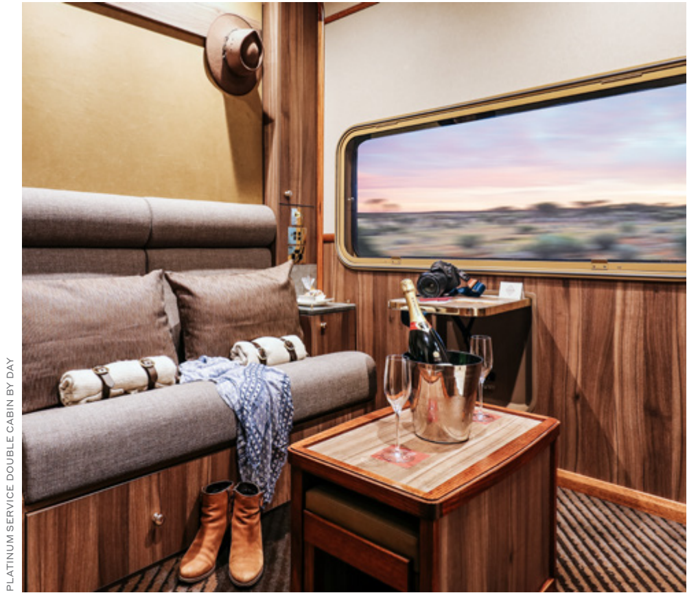
PLATINUM SERVICE DOUBLE CABIN BY DAY

Platinum guests enjoy premium extras like a full-size en suite, expansive window views from both sides of the train, and exclusive use of the Platinum Club carriage. Add to that the luxurious linen, the French champagne, Haigh's chocolates, a nightcap at turndown and more, and you're in for a premium experience. By day, your cabin is configured as a private lounge with deluxe seating, a table and two ottomans. By night, you'll enjoy a deep sleep as the lounges convert into a comfortable bedroom with either, double or twin beds. It's the perfect place to relax and take in the amazing views sweeping past your panoramic windows. Or for a more social experience, head to the beautifully appointed Platinum Club, exclusive to Platinum guests. With a deluxe bar, lounge and fully flexible dining area, the Platinum Club sets the scene for relaxed daytime conversation or elegant dinner with friends.