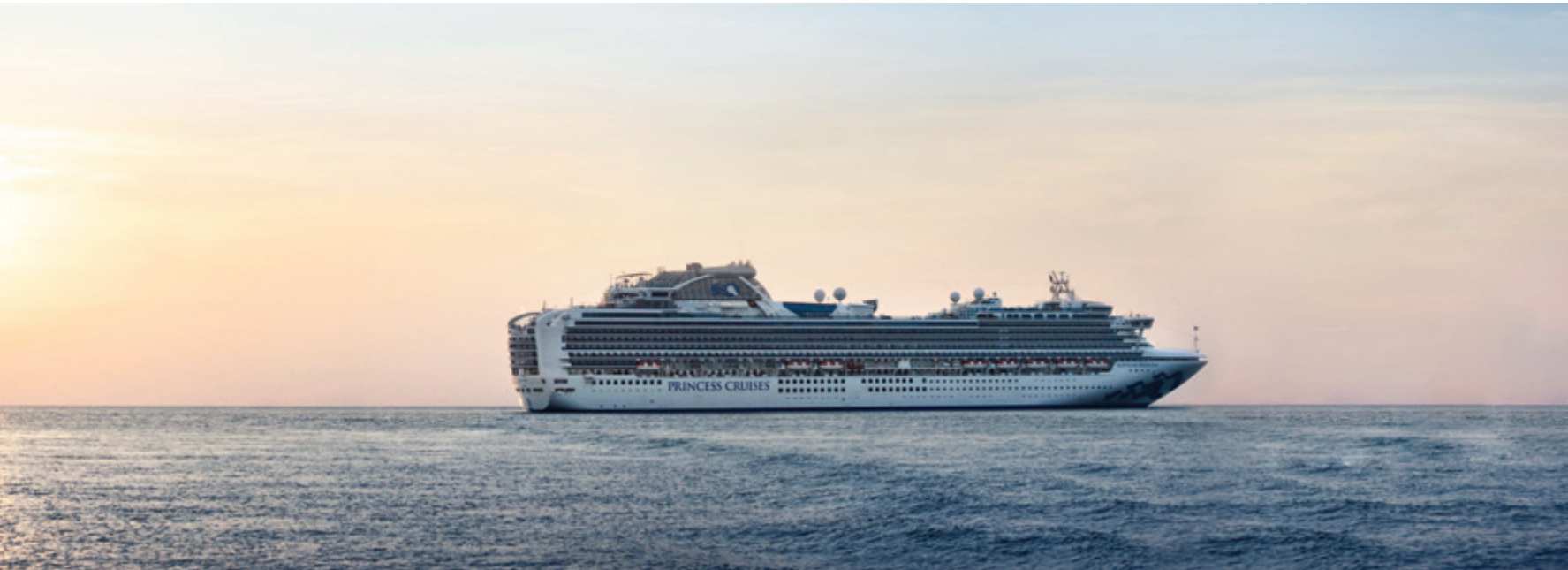
THE SAPPHIRE PRINCESS®

☀ 25 DAYS 🌙 24 NIGHTS | DEPARTURE - 21 MARCH 2021