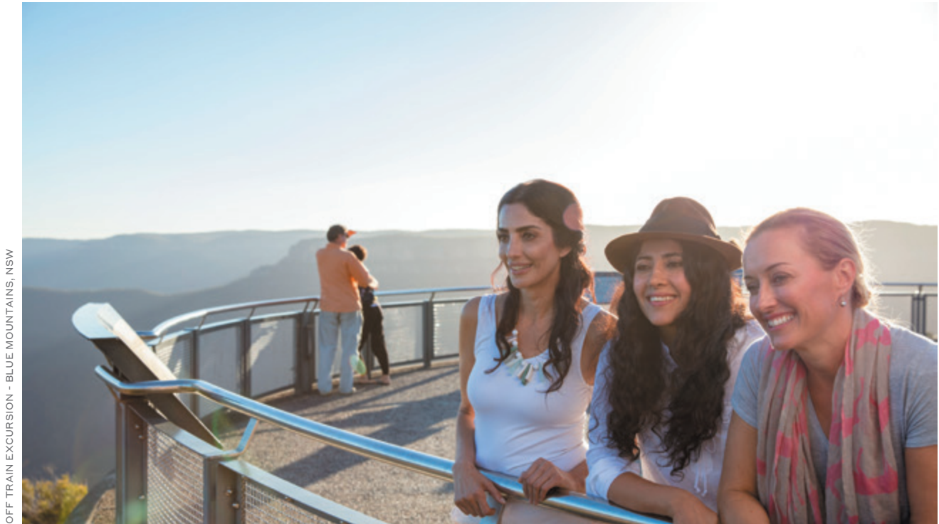
OFF TRAIN EXCURSION - BLUE MOUNTAINS, NSW

Nothing enhances the romance of rail travel quite like Platinum Service. Tailored for the discerning traveller, our Platinum Service adds a new level of sophistication to your journey. Stylishly appointed and spacious suites are complemented by discreet, personalised service, world-class food and wine, and access to the exclusive Platinum Club for meals, relaxation and socialising. And it all begins before you've even stepped aboard. Our Platinum Service guests can also take advantage of private transfers before and after the journey. And, as you'd expect, once your adventure begins the food and wine included is of the highest standard. Enjoy hearty breakfasts, two-course lunches and four-course dinners, all regionally-inspired and matched with premium wines.