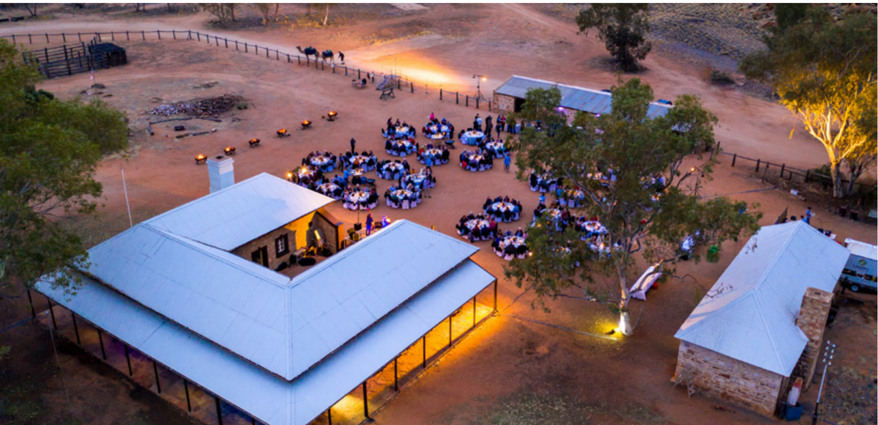
ALICE SPRINGS, NT