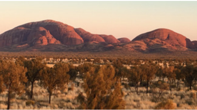
KATA TJUTA, NT

This morning it's time to check out of your hotel, completing your life-changing two-week adventure. (B)