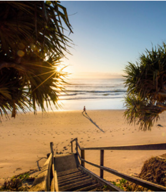
COFFS HARBOUR, NSW