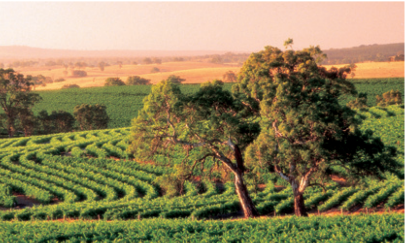
BAROSSA VALLEY, SA

☀️ 5 DAYS 🌙 4 NIGHTS | DEPARTURE - DAILY