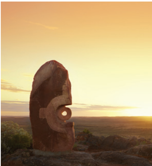
BROKEN HILL, NSW