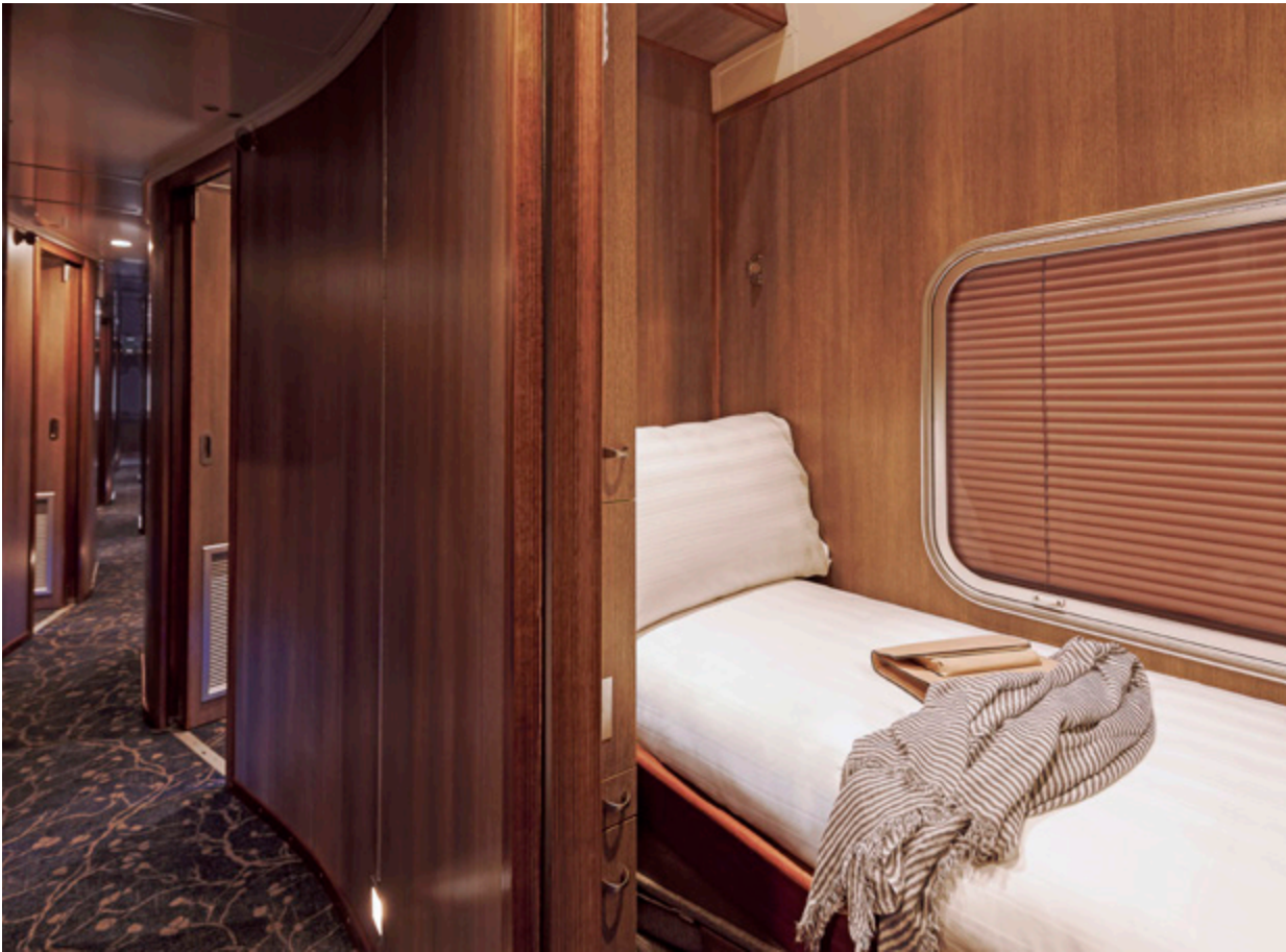
GOLD SERVICE SINGLE CABIN BY NIGHT