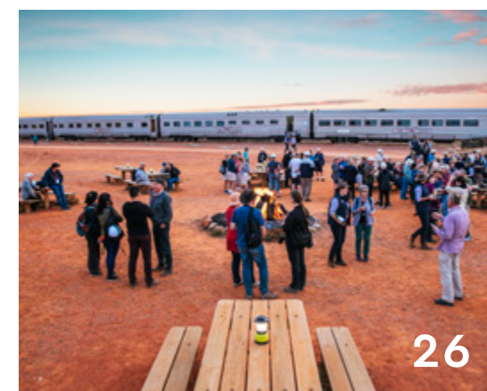
THE GHAN EXPEDITION JOURNEYS