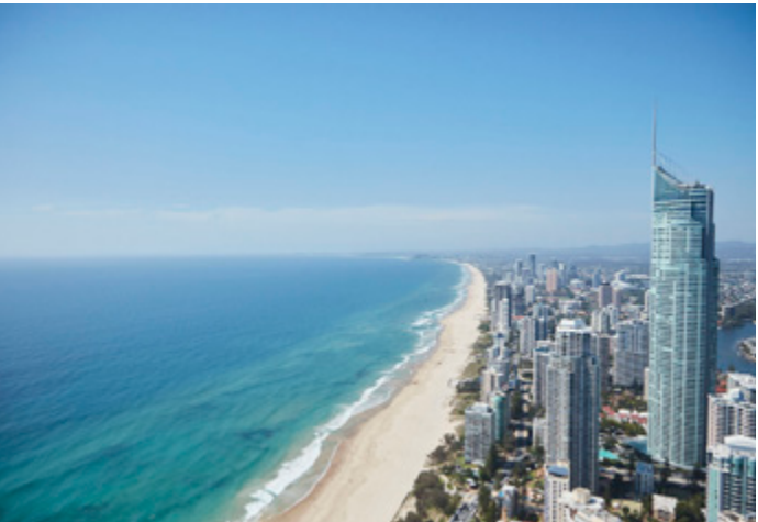
SURFERS PARADISE, QLD

Check out of your accommodation this morning and head back to Brisbane, returning your hire car as your adventure in the tropics comes to an end.