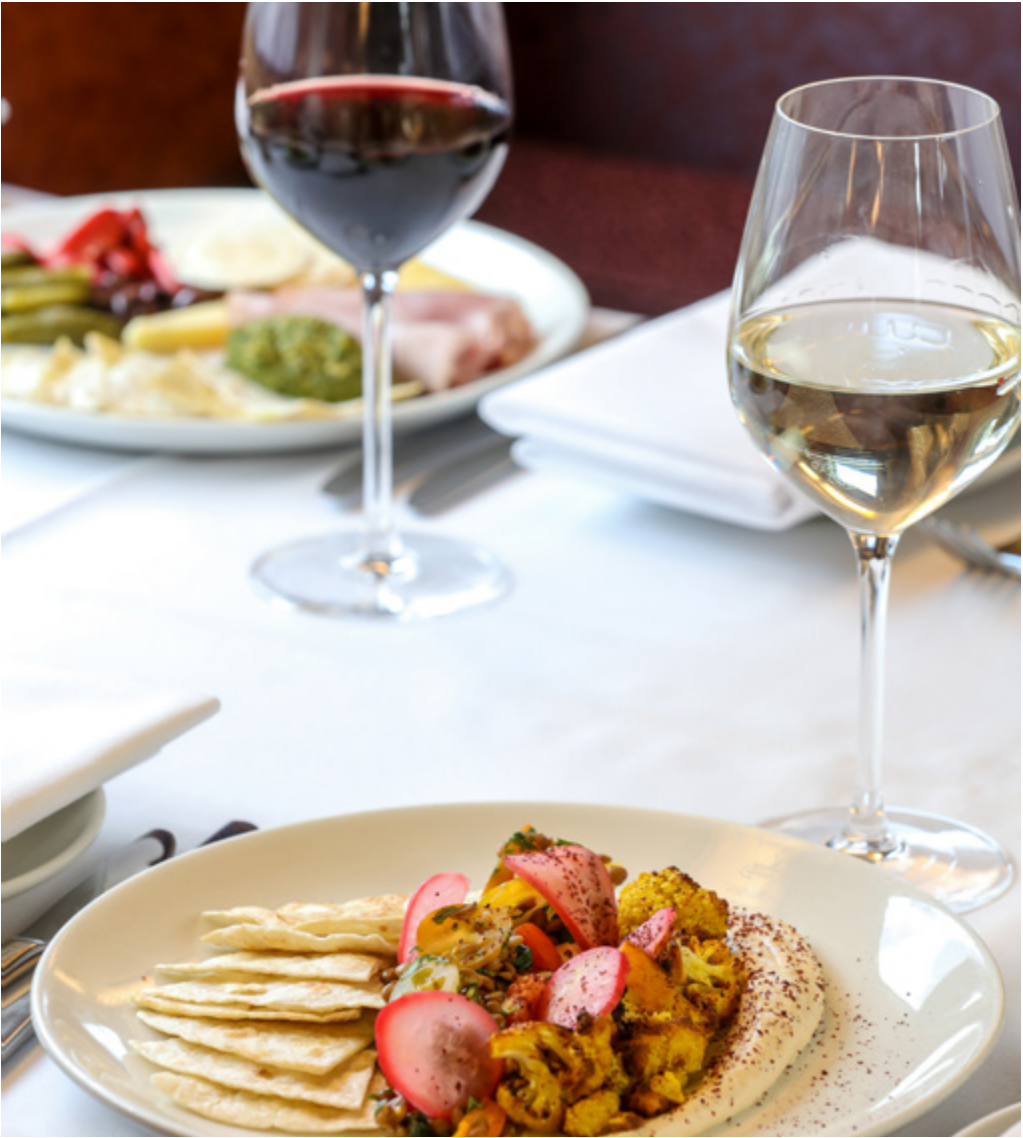
QUEEN ADELAIDE RESTAURANT