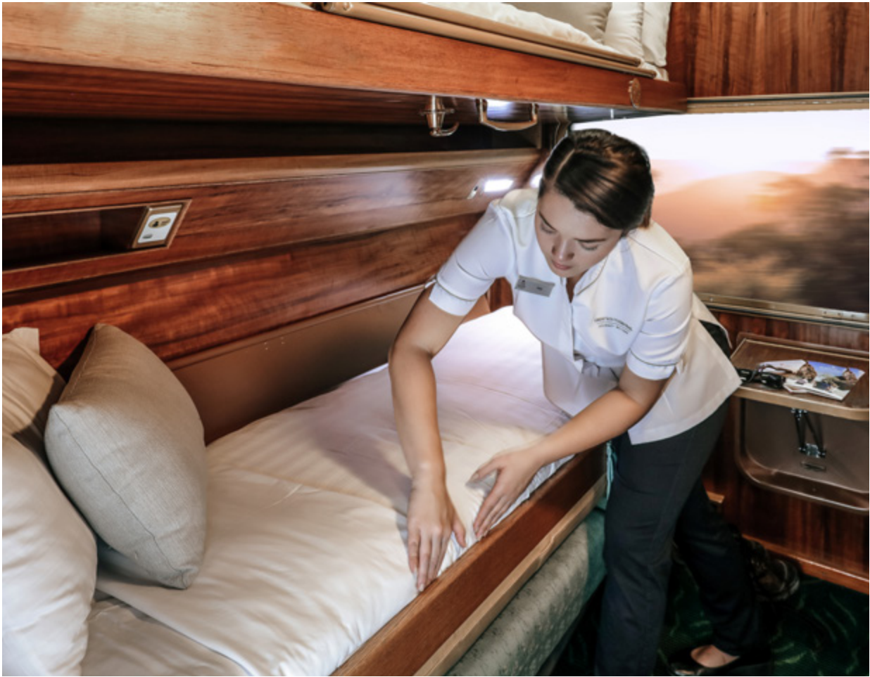
GOLD SERVICE TWIN CABIN BY NIGHT