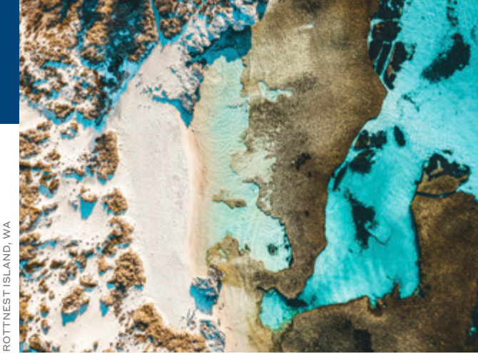
ROTTNEEST ISLAND, WA

Today it's time to check out of your hotel, finishing up your visit to this cosmopolitan city.