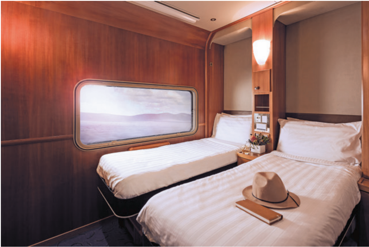
PLATINUM SERVICE TWIN CABIN BY NIGHT