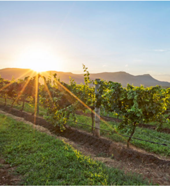
HUNTER VALLEY, NSW