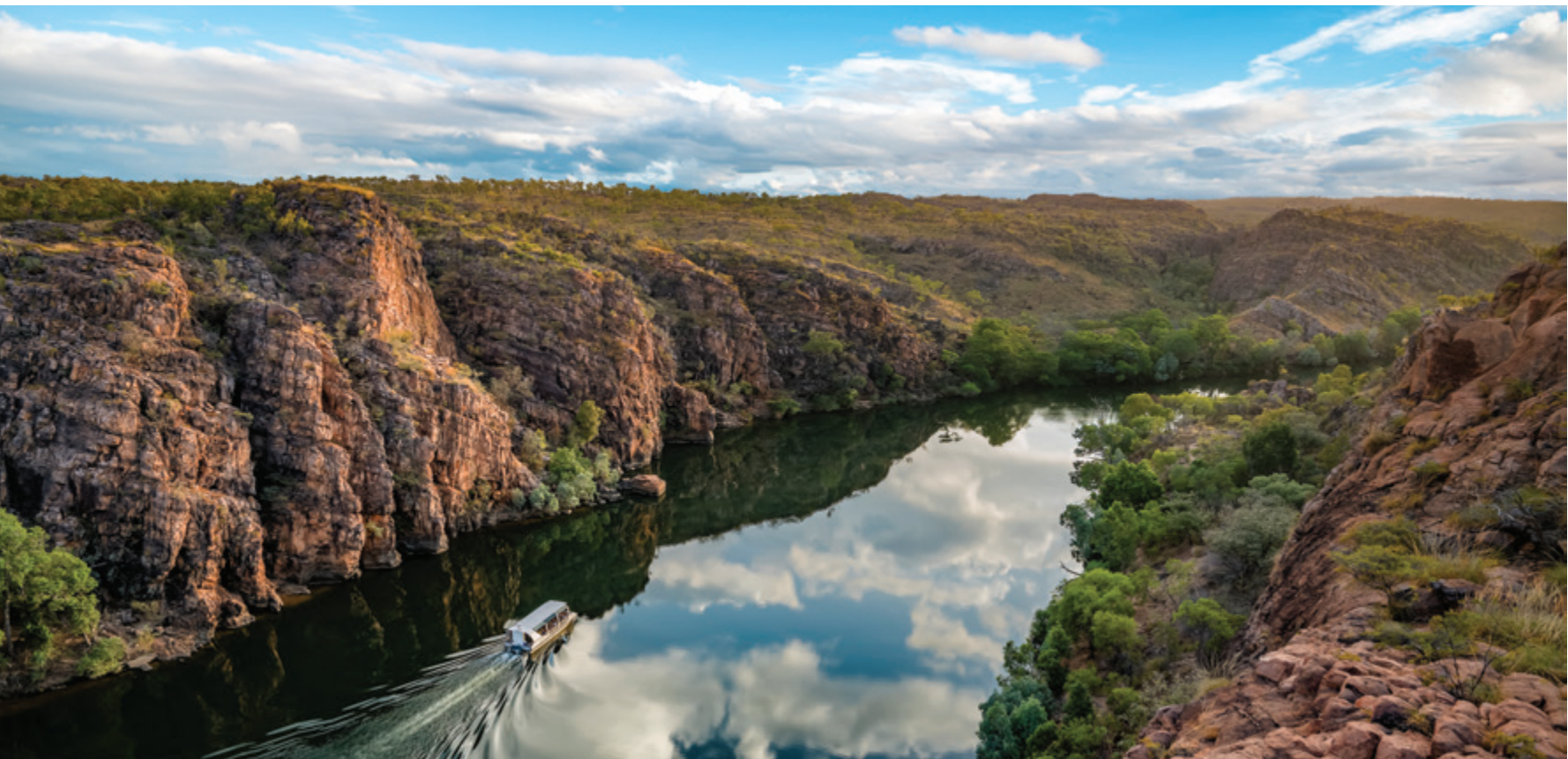
NITMILUK (KATHERINE GORGE), NT