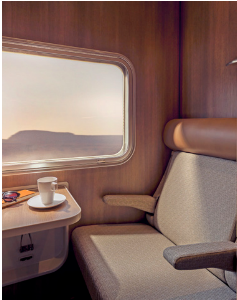
GOLD SERVICE SINGLE CABIN BY DAY