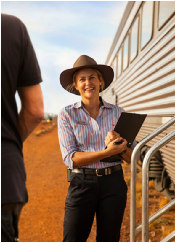
GOLD SERVICE HOSPITALITY ATTENDANT