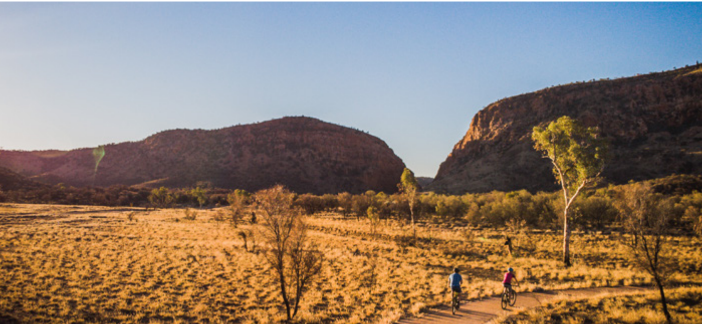
ALICE SPRINGS, NT

☀️ 2 DAYS 🌙 1 NIGHT | DEPARTURES (S) M T (W) (T) ** F S