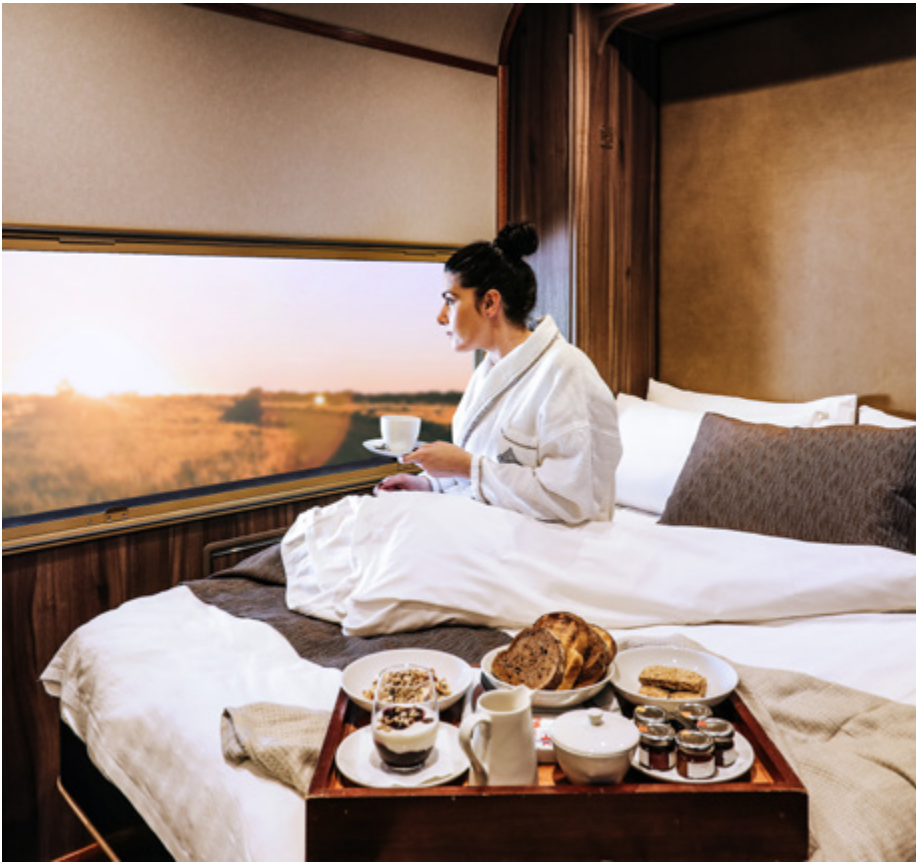
PLATINUM SERVICE DOUBLE CABIN BY MORNING