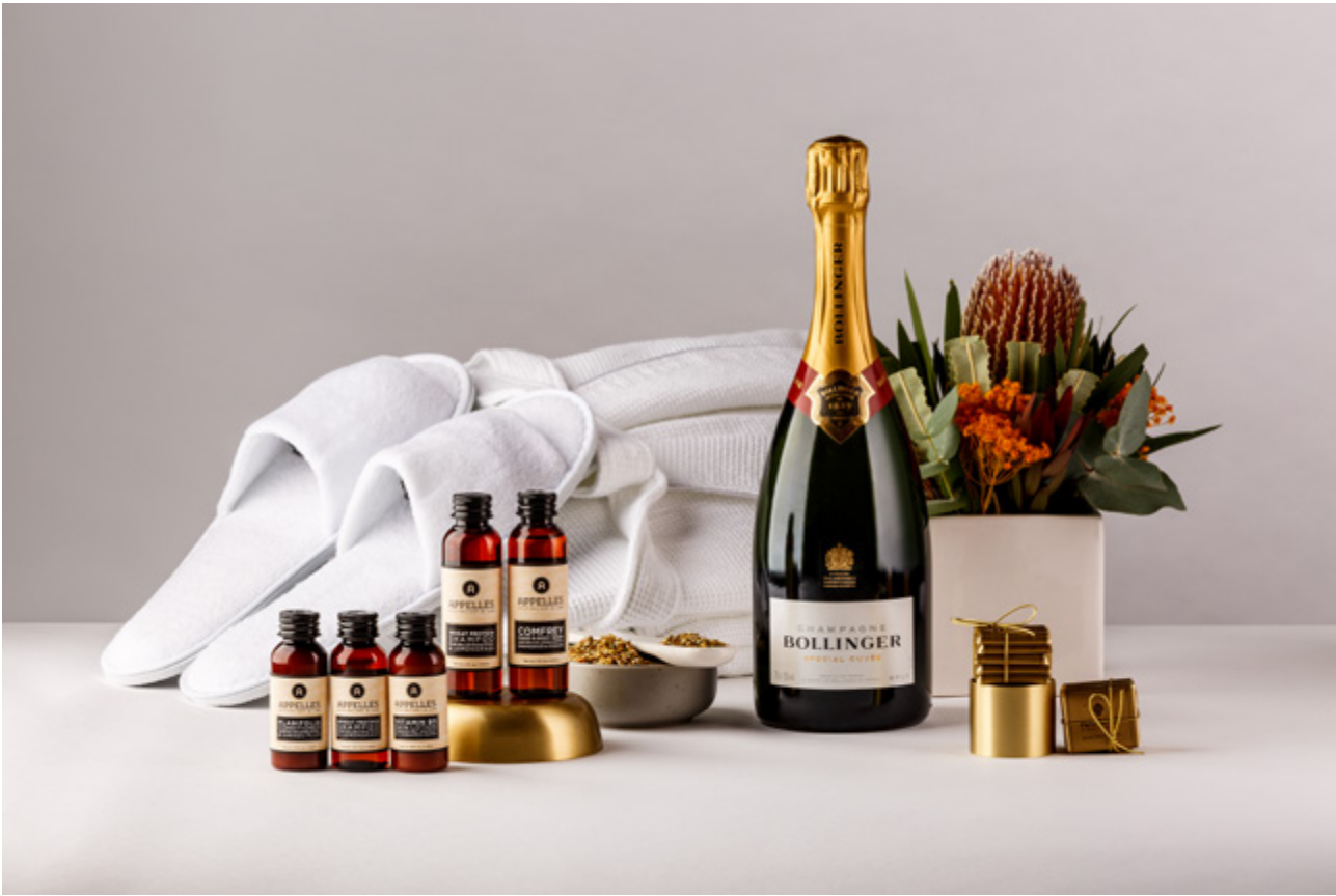
PLATINUM SERVICE AMENITIES