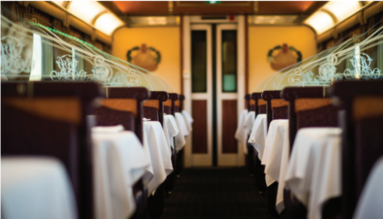
QUEEN ADELAIDE RESTAURANT

Immerse yourself in a world of romance that epitomises rail travel with our Gold Service offering. Our most popular service option has everything you'll need to feel at home for the duration of your journey. Choose between Gold Service Twin and Single Cabins, both of which provide the perfect place to relax and recharge after a day of off train experiences. Spend hours deep in conversation with new friends in the shared Outback Explorer Lounge area or lose yourself in a lifetime of thoughts, then make your way to the Queen Adelaide Restaurant for a drink or a meal. Gold Service fares include hearty breakfasts, two-course lunches and three-course dinners. You may also choose to complement your meal with our selection of premium wines and beverages, which are also included in your fare.