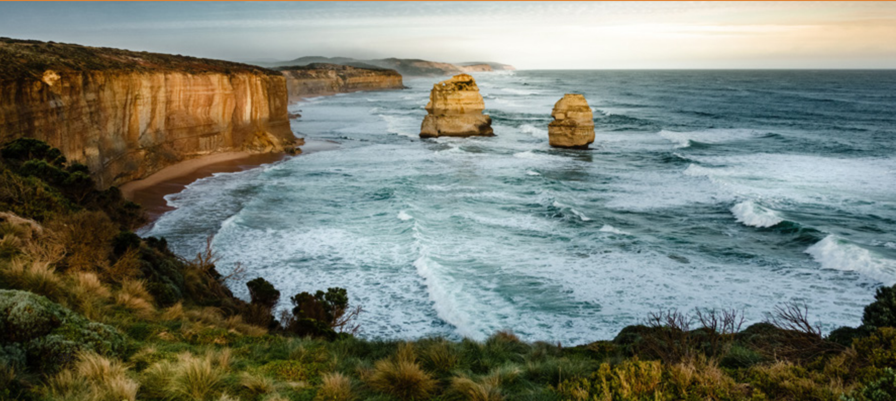
THE TWELVE APOSTLES, VIC

As the train journeys through the charming Adelaide Hills, enjoy your last breakfast on board before arriving into Adelaide and the end of your Great Southern train journey.