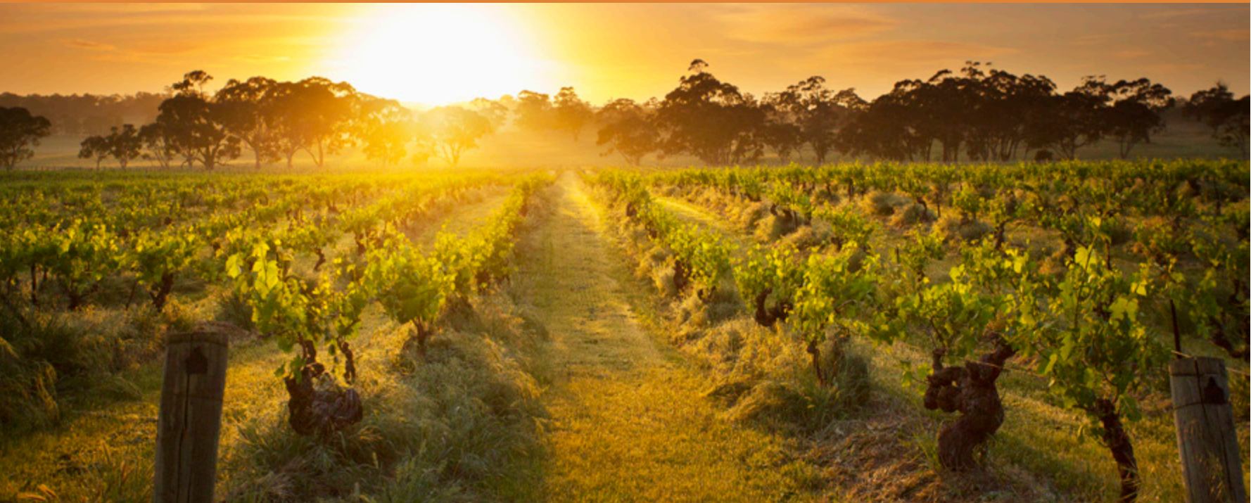
BAROSSA VALLEY, SA