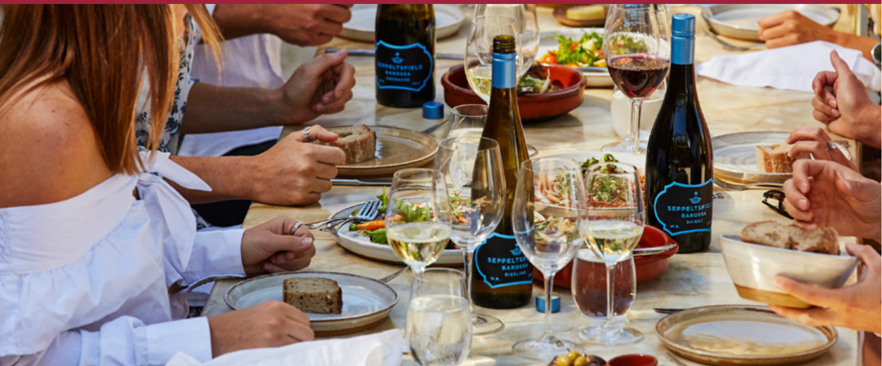
SEPPELTSPFELD, BAROSSA VALLEY, SA

9 DAYS 8 NIGHTS | DEPARTURE S M T W T F S