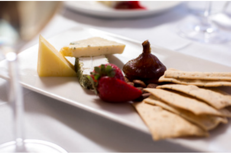
QUEEN ADELAIDE RESTAURANT

Today is yours to explore cosmopolitan Perth at your leisure. Take a walk to the new Elizabeth Quay, cruise the Swan River, stroll Kings Park, see the quokkas of Rottnest Island with Rottnest Express, or simply relax in the comfort of your accommodation. (B)