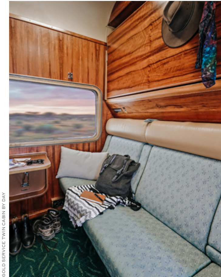
GOLD SERVICE TWIN CABIN BY DAY

60 kg checked luggage allowance per guest (2 x 30 kg each)