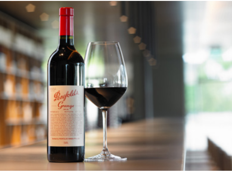
PENFOLDS MAGILL ESTATE, BAROSSA VALLEY, SA

As far as gourmet experiences go, today you are about to indulge in one of Australia's absolute best. The legendary Penfolds Magill Estate – where some of the world's great wines are produced – is your venue for an epicurean adventure you'll never forget.