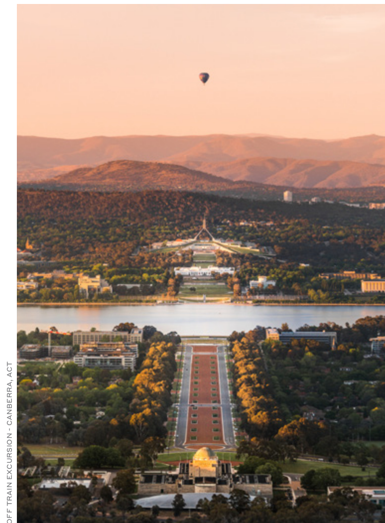
OFF TRAIN EXCURSION - CANBERRA, ACT