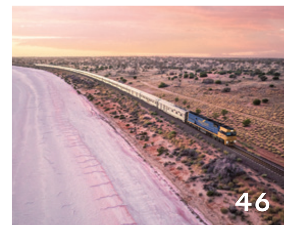
INDIAN PACIFIC JOURNEYS