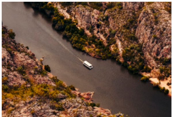
NITMILUK (KATHERINE), NT