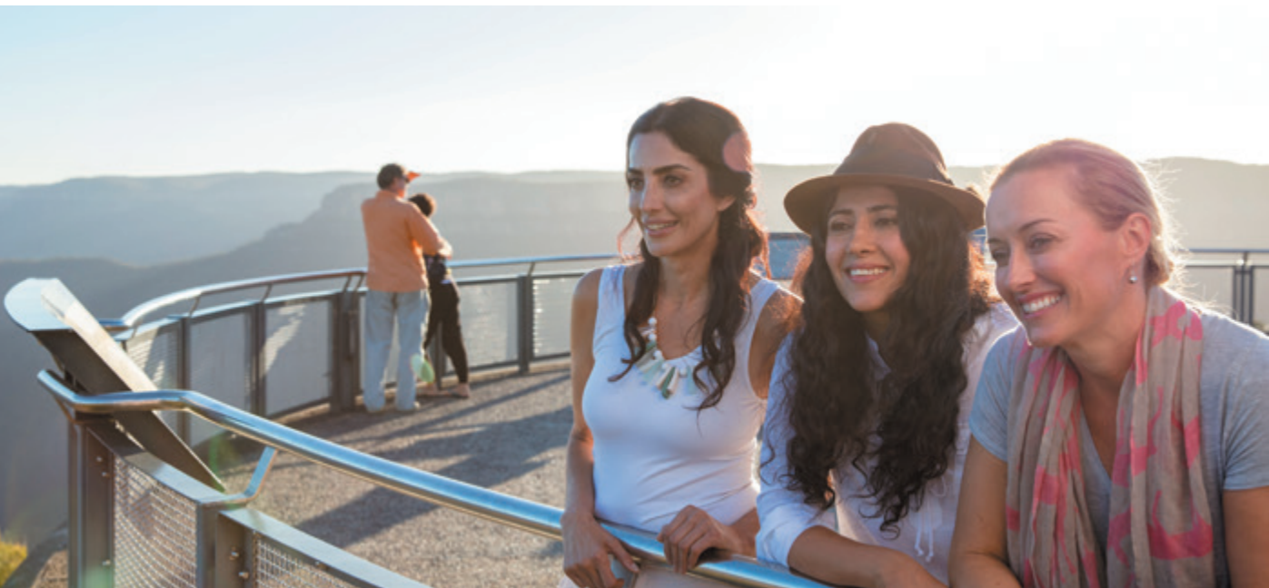
BLUE MOUNTAINS, NSW

☀️ 2 DAYS 🌙 1 NIGHT | DEPARTURE S M T W T F S