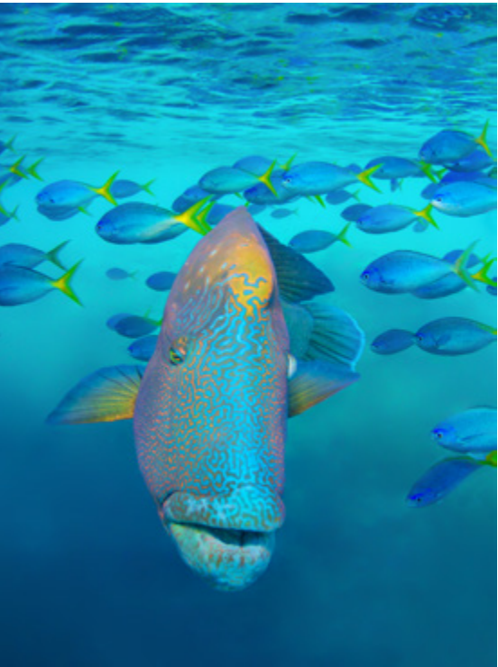
GREAT BARRIER REEF, QLD

SCENIC, SUNNY AND SOPHISTICATED, THE SUBTROPICAL CITY OF BRISBANE OFFERS A UNIQUE BLEND OF OPEN-AIR ADVENTURE AND URBAN CULTURE. AND ON THE DOORSTEP OF THE SULTRY CAPITAL, DISCOVER THE SURF, SAND AND ELECTRIC ENERGY OF THE GOLD COAST, OR PLUNGE INTO THE TURQUOISE WATERS OF THE WONDERFUL WHITSUNDAYS.