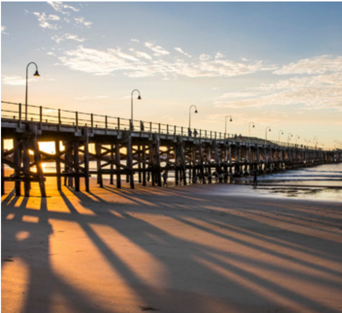
COFFS HARBOUR, NSW