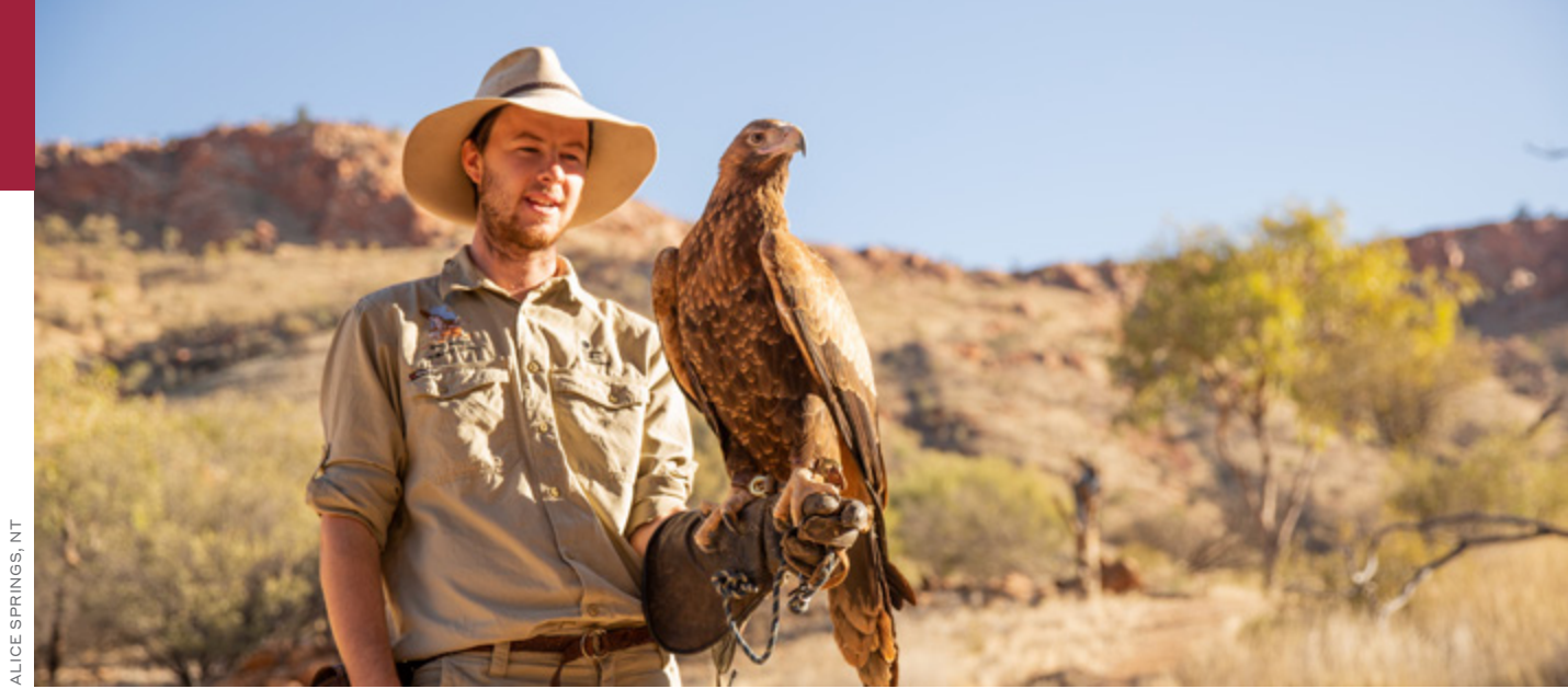
ALICE SPRINGS, NT

Alice Springs to Darwin (6 Days, 5 Nights) Darwin to Alice Springs (6 Days, 5 Nights) Adelaide to Darwin (7 Days, 6 Nights) Darwin to Adelaide (7 Days, 6 Nights)