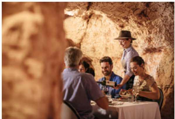
COOBER PEDY, SA