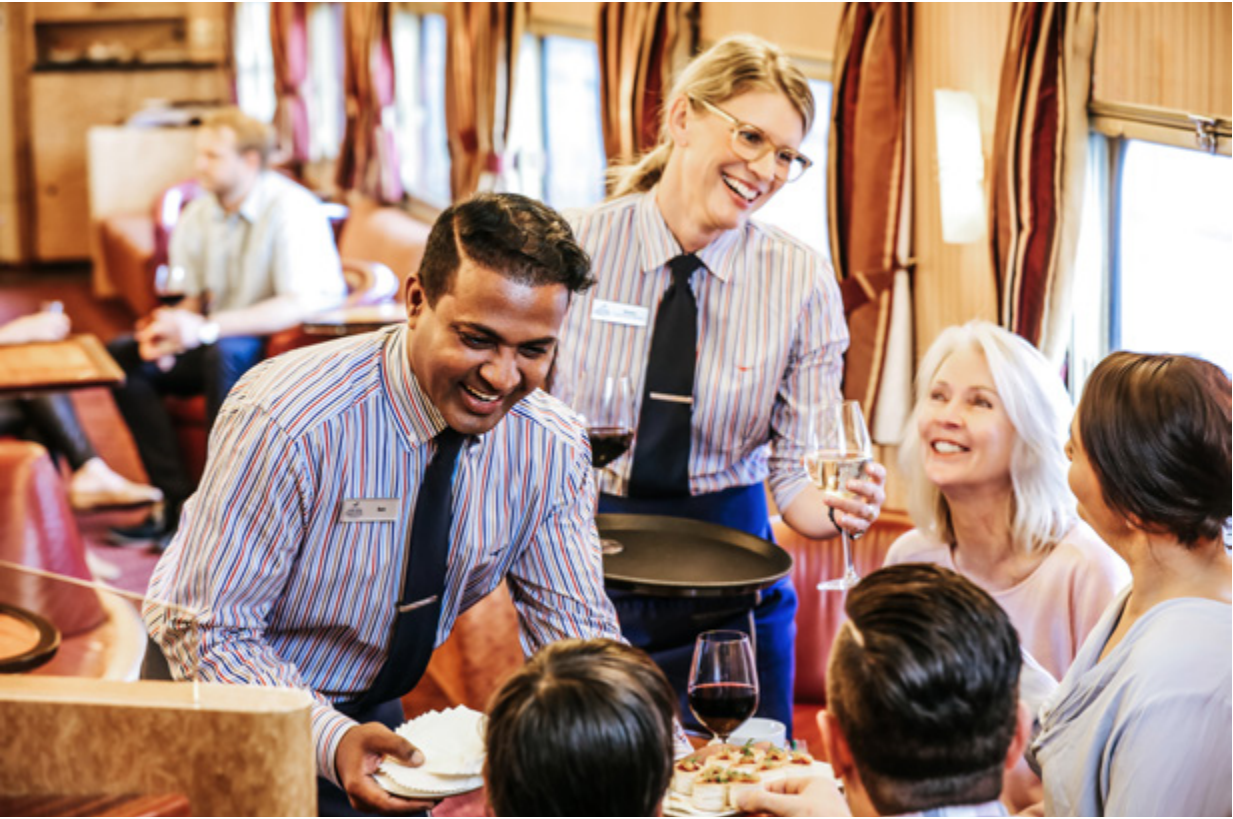
OUTBACK EXPLORER LOUNGE