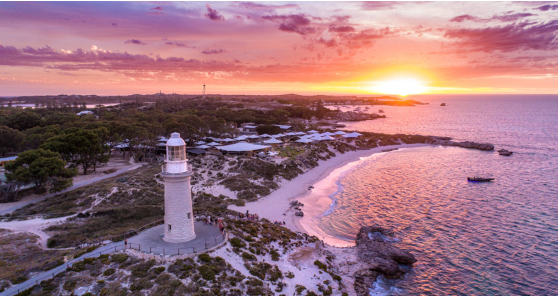
ROTTNEST ISLAND, WA

After breakfast, check out of your accommodation. (B)