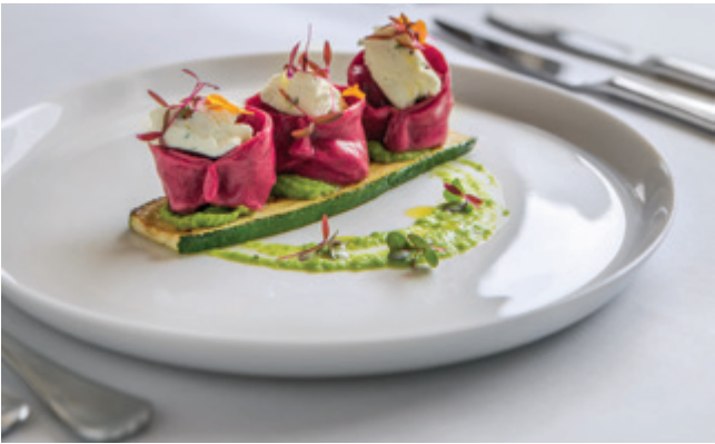
QUEEN ADELAIDE RESTAURANT

After breakfast, it's time to check out of your accommodation, finishing your epicurean adventure. (B)