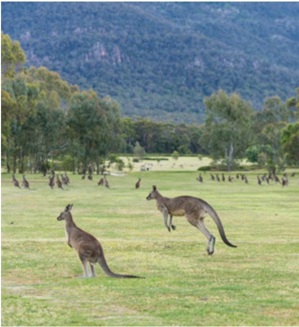
THE GRAMPIANS, VIC