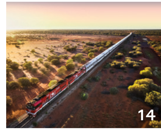
THE GHAN JOURNEYS