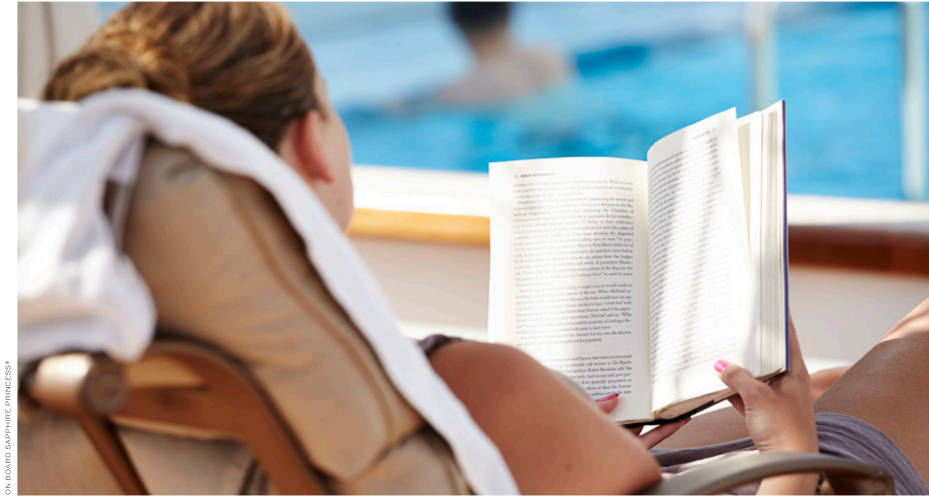
ON BOARD SAPPHIRE PRINCESS®

Australia's northern capital lies at the heart of the tropics and is home to more than half of the Northern Territory's population. A popular starting point for journeys through the many attractions of the Top End wilderness regions, there's also plenty of fascinating history to explore in and around Darwin. (B,L,D)