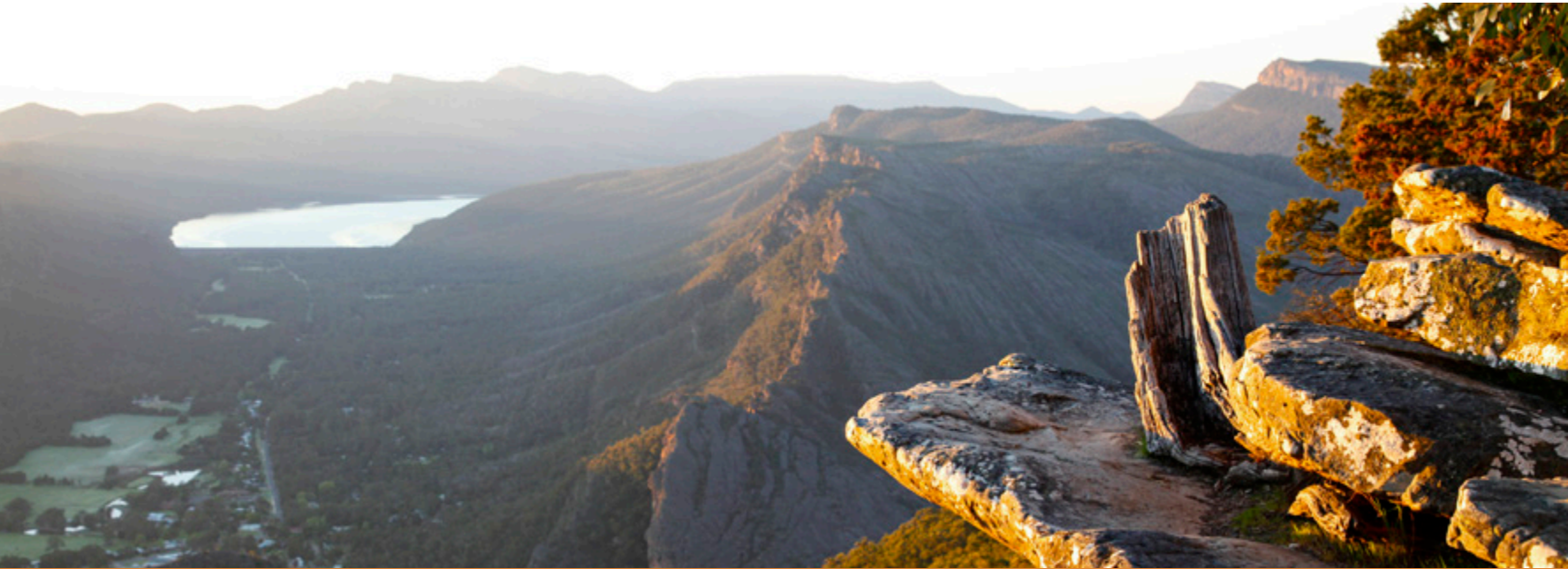
THE GRAMPIANS, VIC