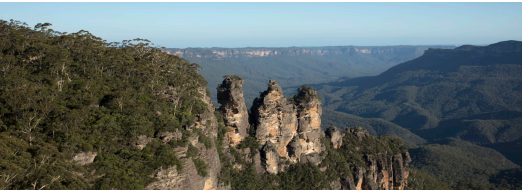
BLUE MOUNTAINS, NSW