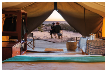
SAL SALIS, NINGALOO REEF, WA