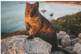
ROTTNEST ISLAND, WA