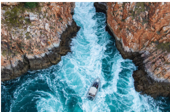
HORIZONTAL FALLS, WA

4 days, 3 nights aboard the Indian Pacific, Perth to Sydney in Gold Service including all meals, beverages and Off Train Experiences